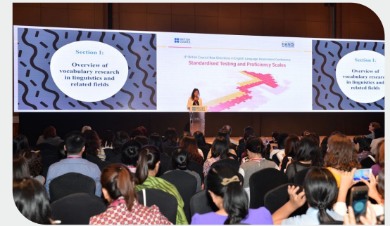
New Directions 2016 – Hanoi