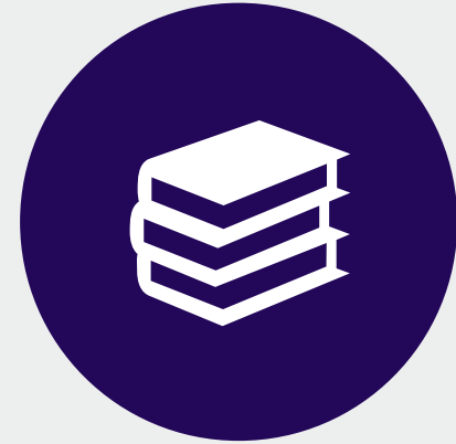
Language Testing Academics