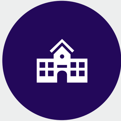
Education and Testing Practitioners