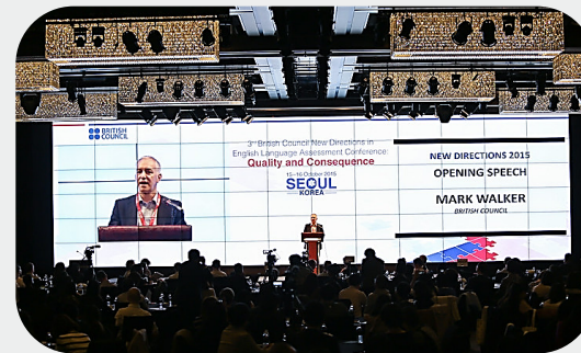
New Directions 2015 – Seoul