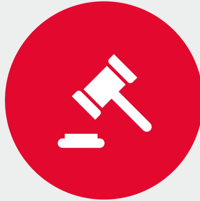
Policy Makers and Implementers