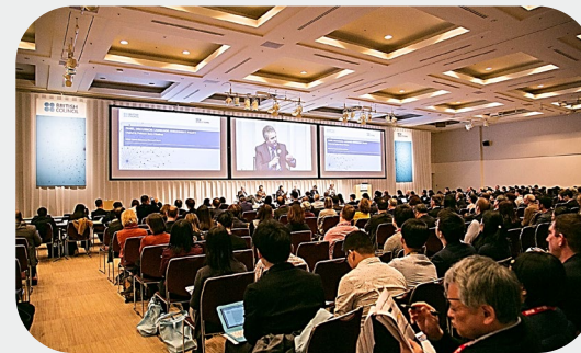
New Directions 2019 – Yokohama