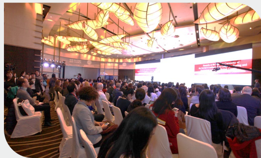
New Directions 2017 – Shanghai