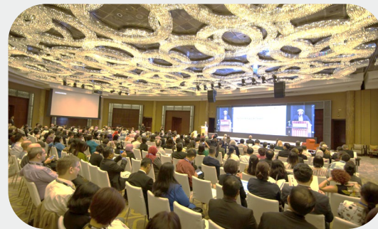
New Directions 2018 – Kuala Lumpur