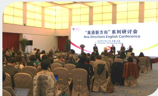
New Directions 2013 – Beijing

The annual British Council English language assessment conference in East Asia has been held since 2013, visiting the following cities: