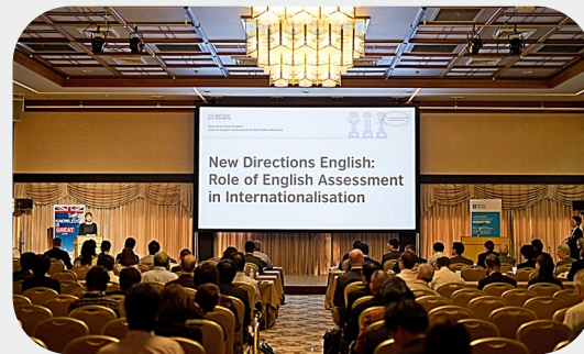
New Directions 2014 – Tokyo